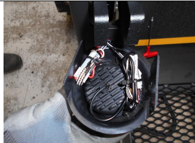
use a cable ties (not supplied) to collect. and place them in the frog light body.