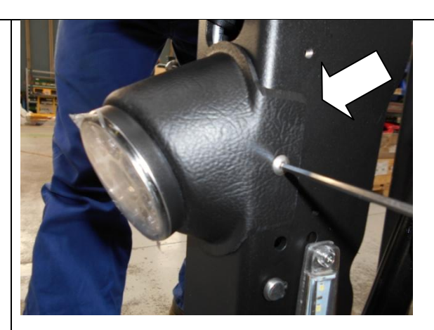
The light support has n.2 holes for fixing to the vertical arm. You must block a side of the support temporarily by proceeding: